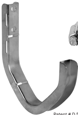
Patent # D 558,567 Made in USA

Optional installation allows installer to secure water header by using a stainless band or cable tie threaded through horizontal slot then secure band or tie around water header and through the front channel of the bracket.